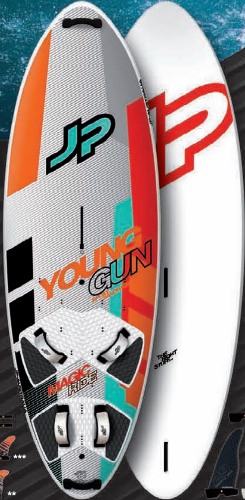
YOUNG GUN MAGIC RIDE (ES)