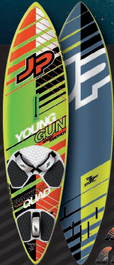
YOUNG GUN RADICAL THRUSTER QUAD (ES)

EPOXY SANDWICH Technology INFLATABLE Light Edition Drop Stitch Technology