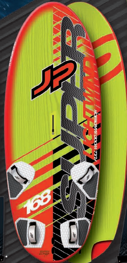
FULL WOOD SANDWICH