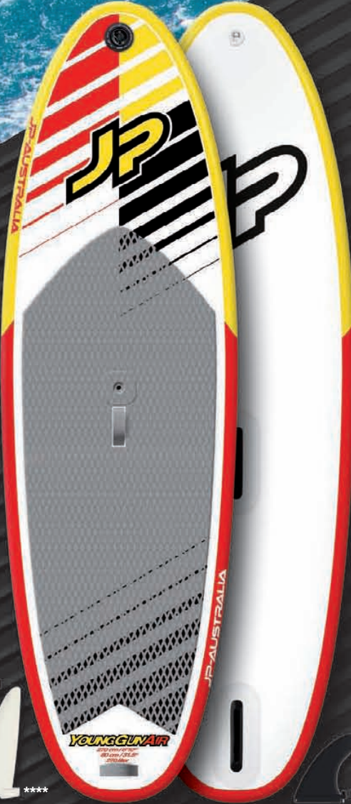
YOUNG GUN AIR (Inflatable)