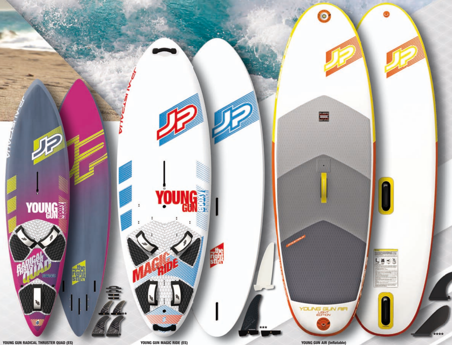
YOUNG GUN RADICAL THRUSTER QUAD (ES)

ES = EPOXY SANDWICH Technology INFLATABLE Light Edition Drop Stitch Technology