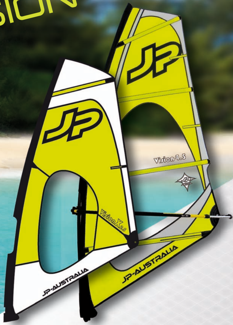
JP RIG VISION X