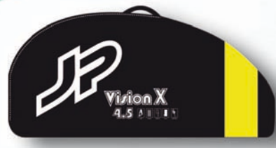
EQUIPMENT BAG VISION X