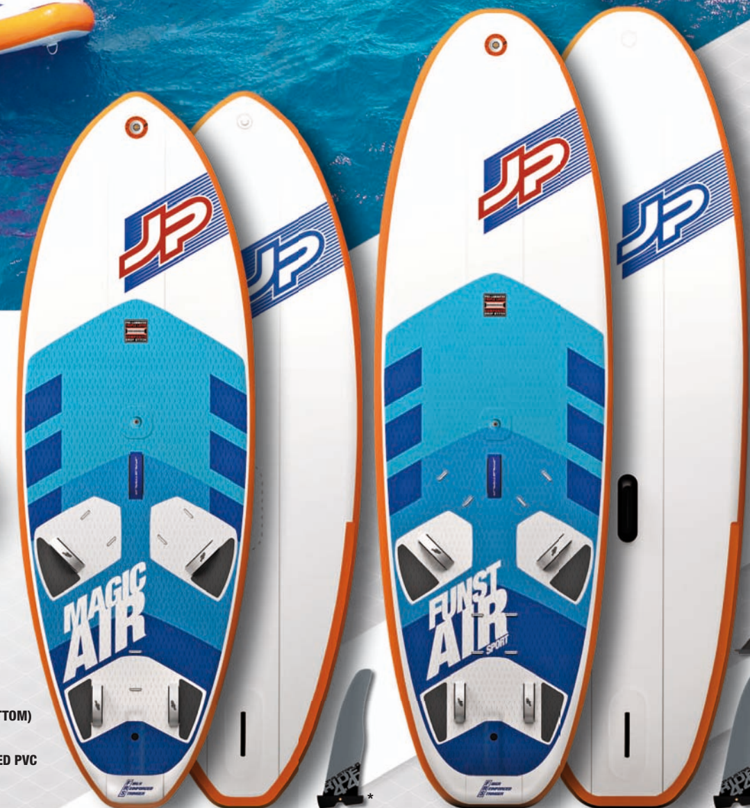
INFLATABLE MAGICAIR 150