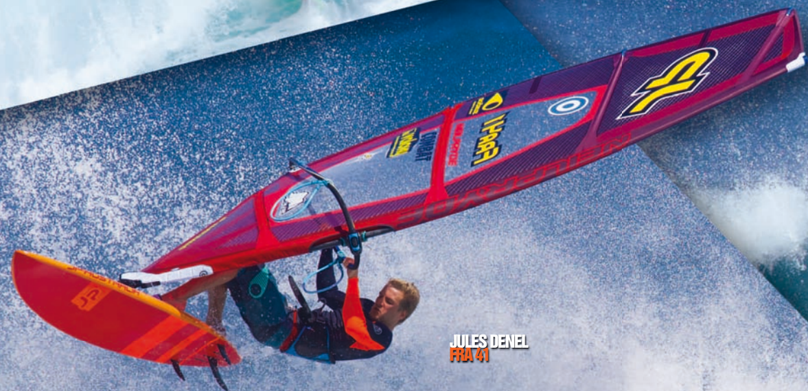
JULES DENEL M1A 41