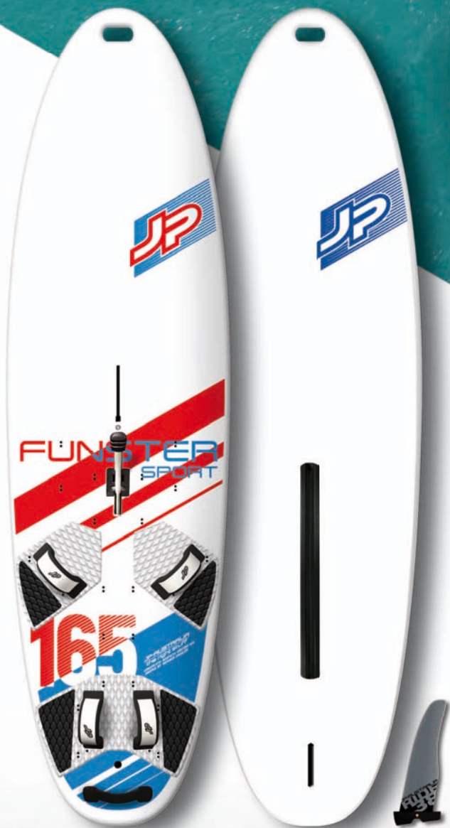
ASA SANDWICH WITH FULL EVA DECK