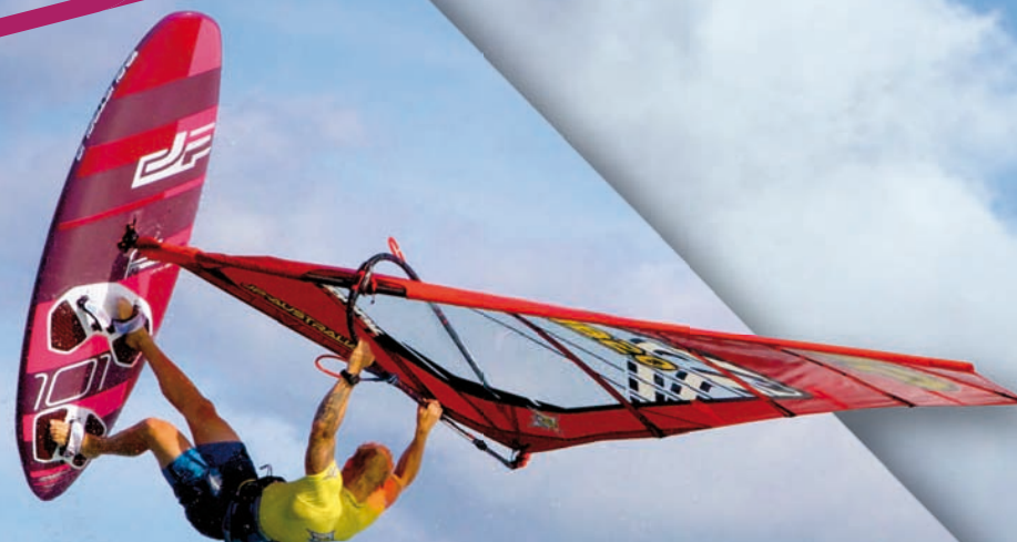
AMADO VRIESWIJK NB 20