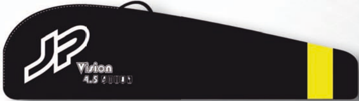
EQUIPMENT BAG VISION