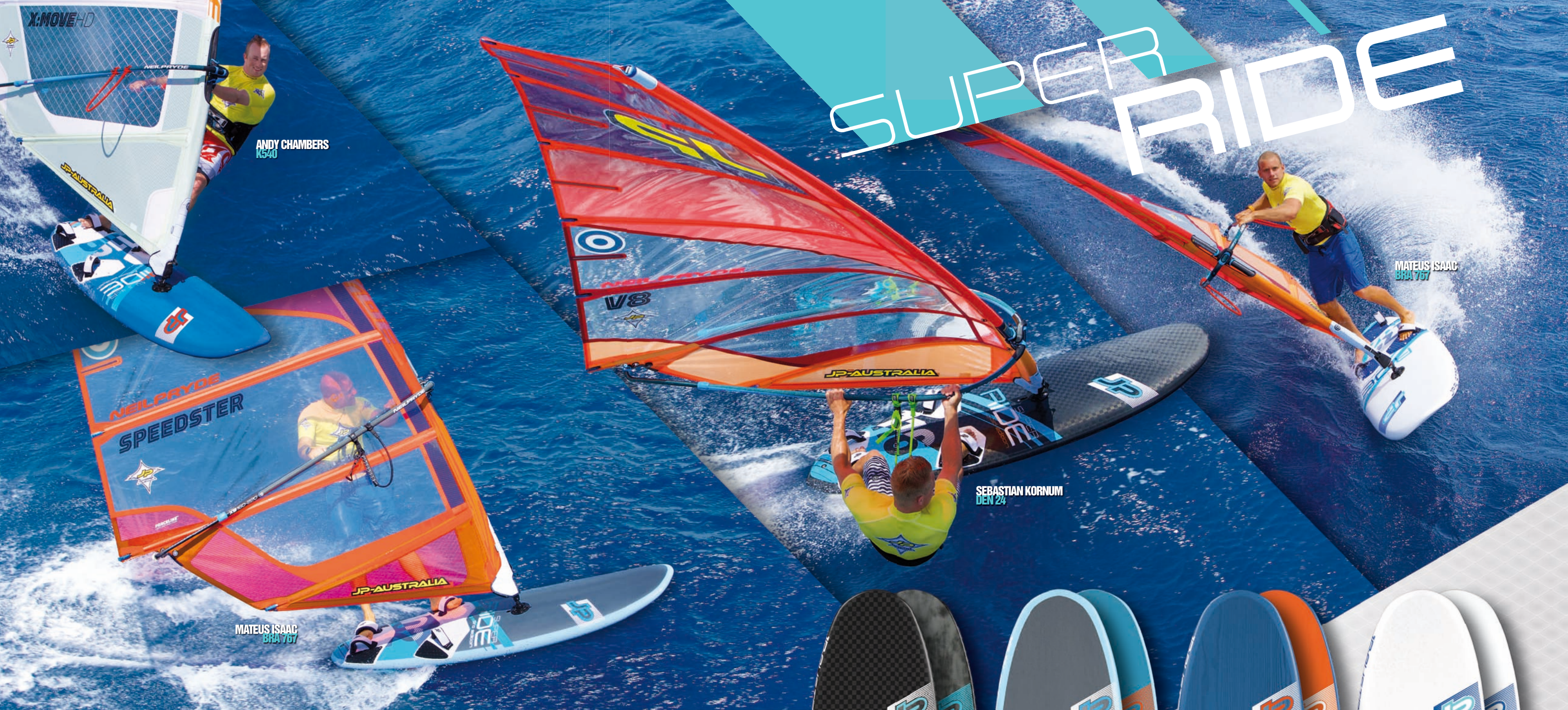
ANDY CHAMBERS K540