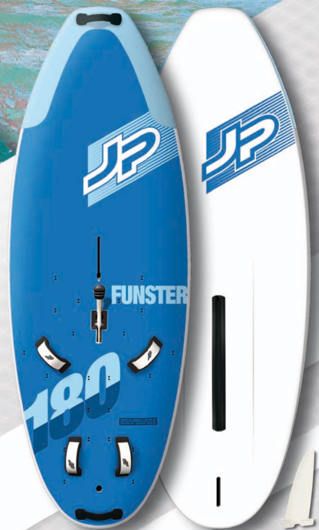
ASA SANDWICH WITH FULL EVA DECK

ASA SANDWICH Technology with full EVA deck and integrated carrying handle.