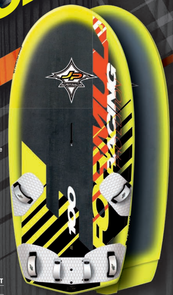
PRO EDITION Deep Tuttlebox