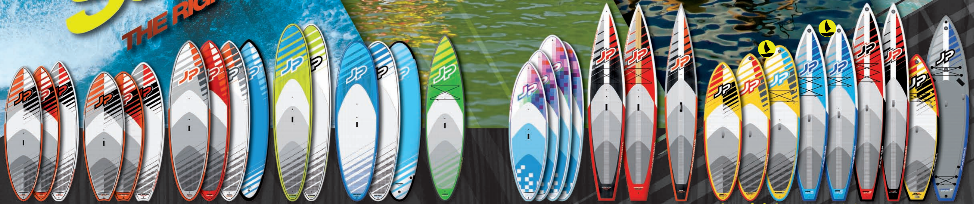
PRO WOOD AST PRO WOOD AST PRO WOOD AST SOFTDECK WOOD AST WOOD AST SOFTDECK WOOD WOOD CARBON WOOD CARBON I N F L A T A B L E S