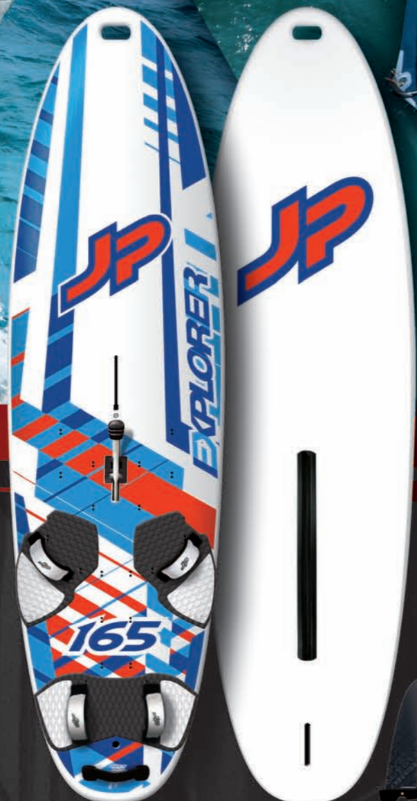
ASA SANDWICH WITH FULL EVA DECK

ASA SANDWICH Technology with full EVA deck and integrated carrying handle.