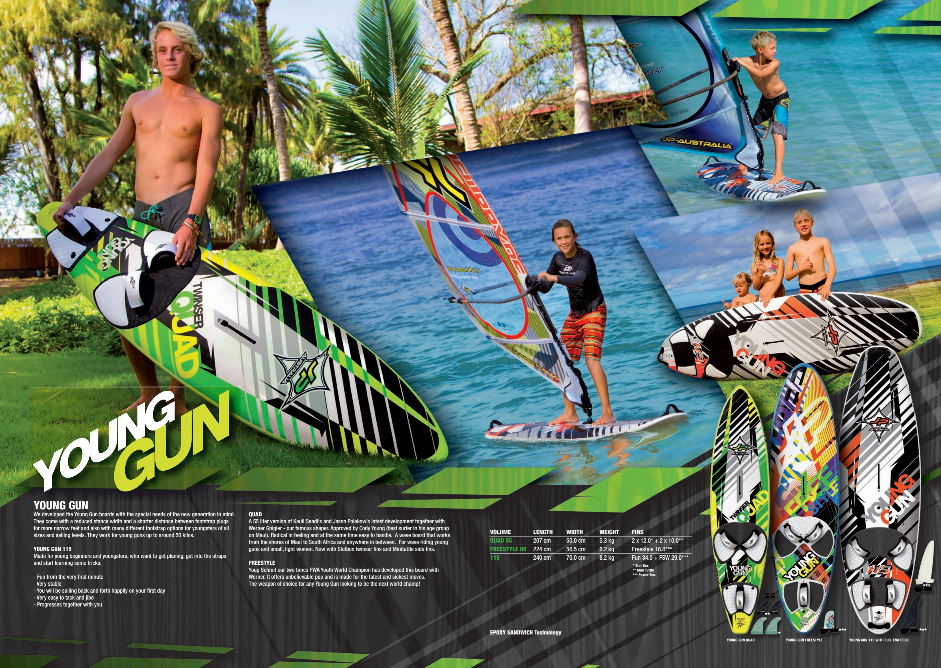
YOUNG GUN 115 WITH FULL EVA DECK