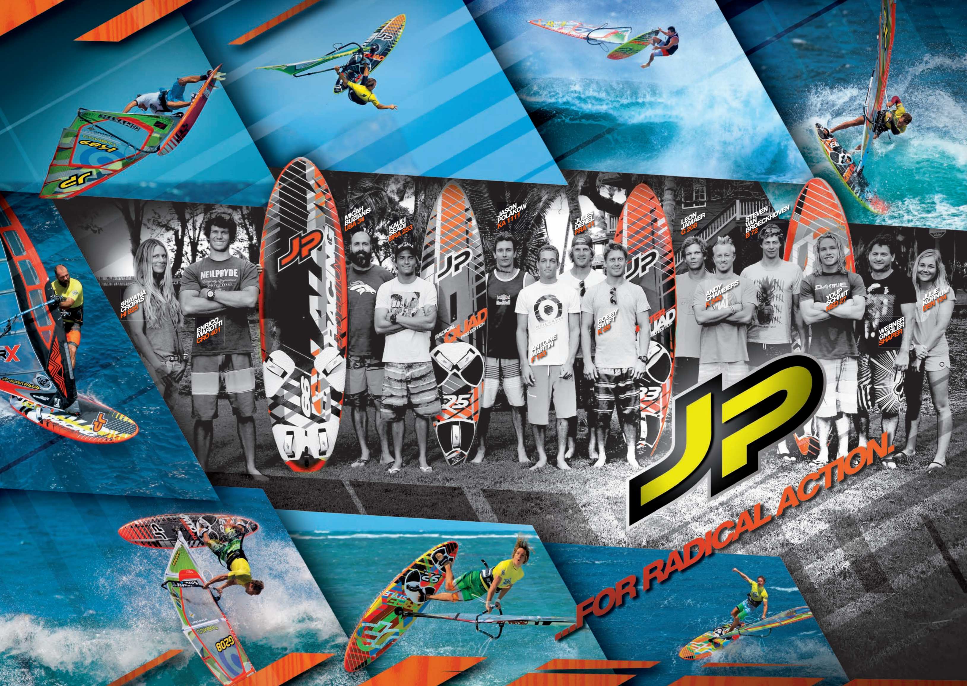
SHAWNA CROPAS HI 925