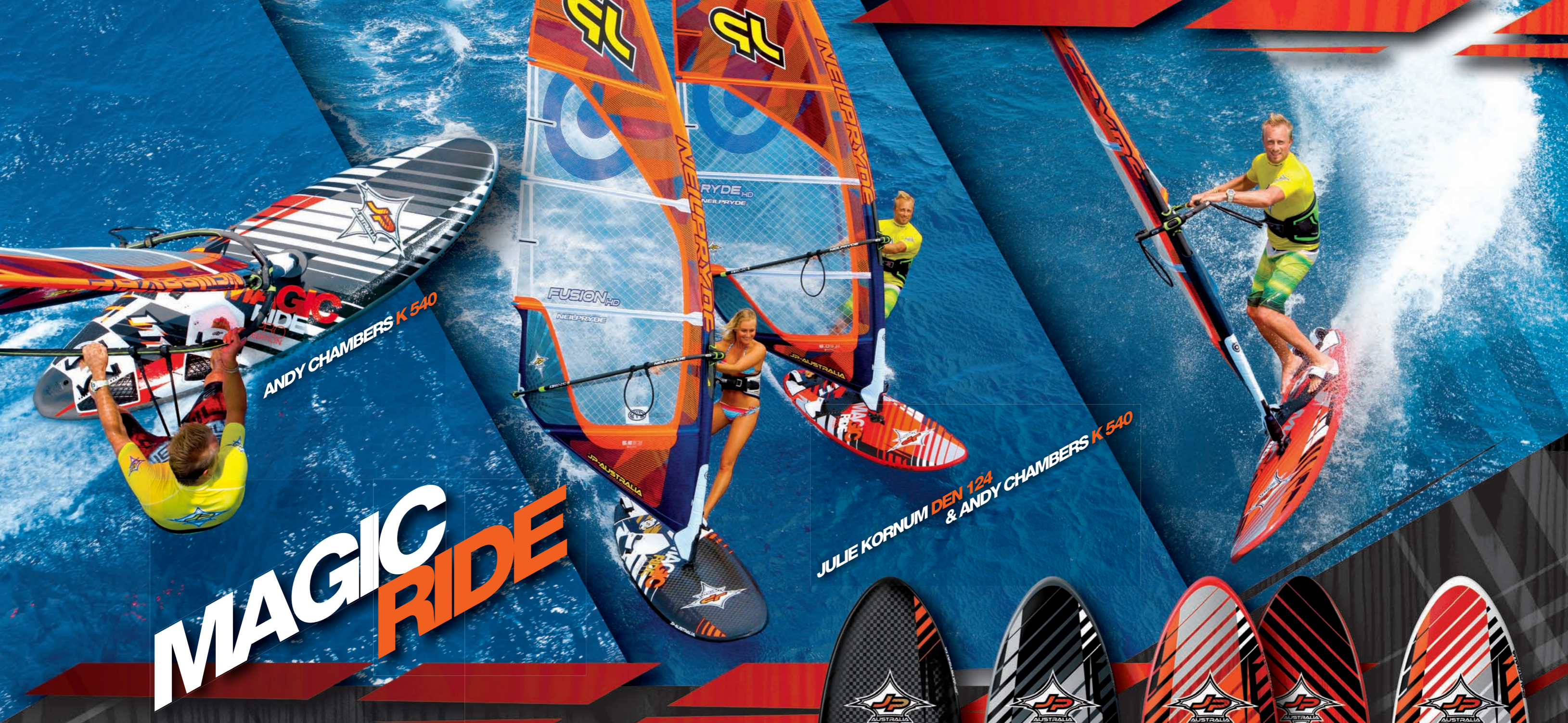
ANDY CHAMBERS K 540