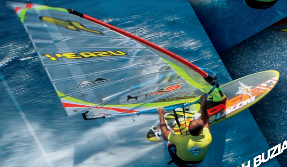
MICAH BUZIANIS USA 34