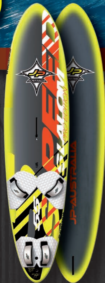
PRO EDITION Tuttlebox

We developed 4 new sizes which are slightly wider and thinner compared to the proven 66 and 80 which stay unchanged. They now come in a 60, 69, 78, and 82 cm width. We widened the range of use. The new 69 is not limited to a sail around 7.6 it can easily handle a 8.4 as well. The new 60 can't just handle sizes 7.0 down, but also a 7.6. The new 82 is much more comfortable and forgiving with big sails like 9.4 than the former 84. The extra width around the mast base increases the planing surface and helps to jump on the plane instantly. The rather pulled-in outline towards the tail gives them a very loose feeling and helps to let them "fly". This outline loads up the fin instantly and lifts the board up for rapid acceleration. It also improves jibing because you can really carve it. To be able to overtake your competitors on the racecourse, boards need to have a "turbo booster". The increasing V flow towards the tail in combination with our cut-outs offer perfect release and the ability to push your speed to a higher level.