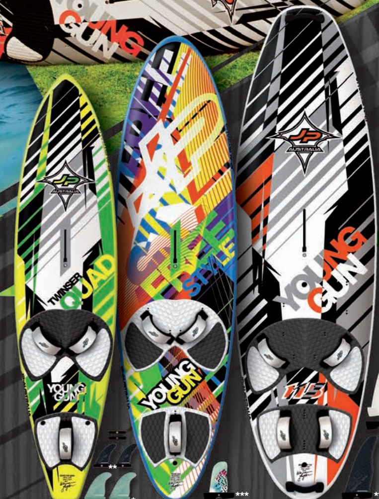
YOUNG GUN QUAD