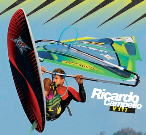
Ricardo Campello V111